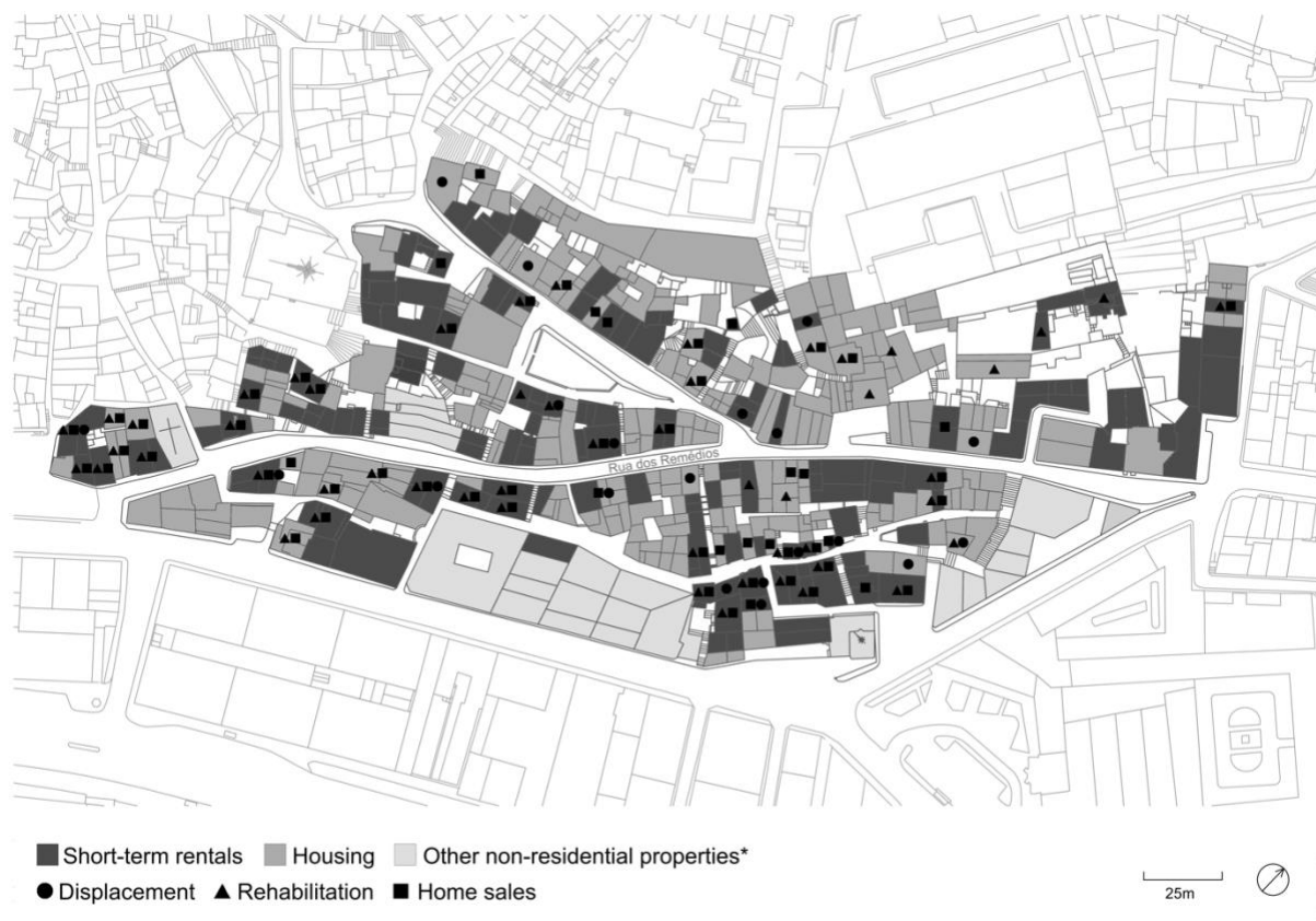
Figure 2. Case study area. Results of the fieldwork indicating the supply of short-term rentals, rehabilitation, home sales and displacement.

*Examples of 'other non-residential properties' include university and government buildings and a church.